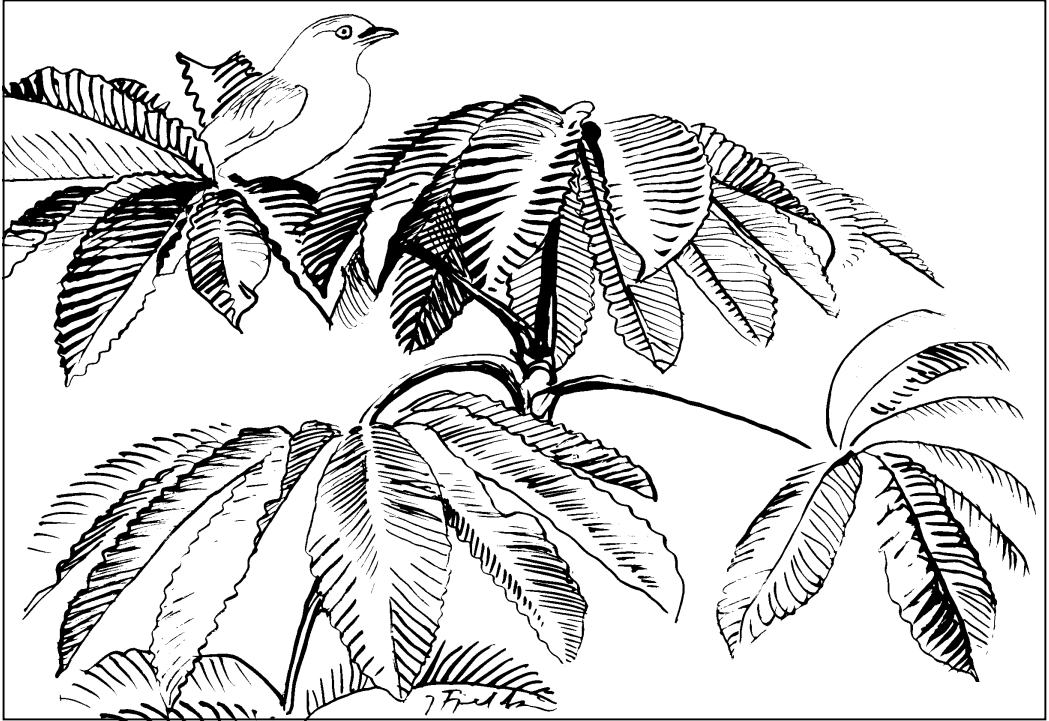
Yellow-billed Cotinga Carpodectes antoniae

C OSTA RICA, like neighbouring Panama, is part of the land-bridge between the very different avifaunas of North and South America, and in consequence a disproportionately large number of bird species, c.850, have been recorded from this small country (50,900 km 2 ) and its territorial waters including Cocos Island (Stiles and Skutch 1989). The species total includes c.600 permanent residents and more than 200 regular migrants (primarily from breeding areas in North America) (Stiles and Skutch 1989). Six species are endemic to the country, 78 have restricted ranges (Stattersfield et al. in prep.) and four are threatened (Collar et al. 1992). This analysis has identified 14 Key Areas for the threatened birds in Costa Rica (see 'Key Areas: the book', p. 11, for criteria).